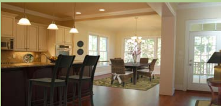
A spacious and sunny kitchen and breakfast.